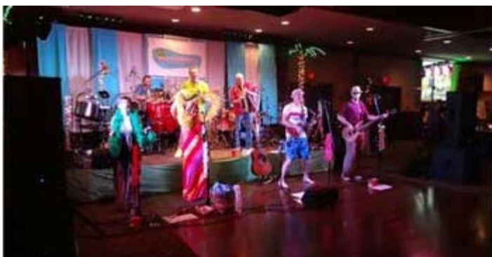
Live music played during The Education Celebration.