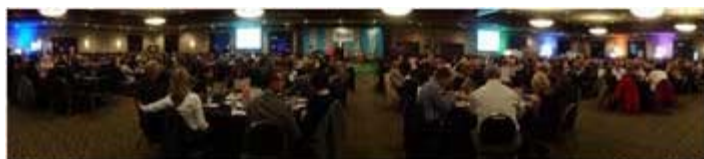
Good times were had and money was raised at The Education Celebration to help NAFC schools.

you can be sure you are making a real difference for the children in our schools!