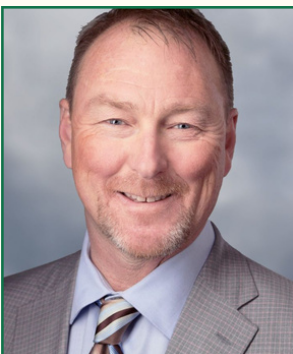
Bobby Libs FC '85