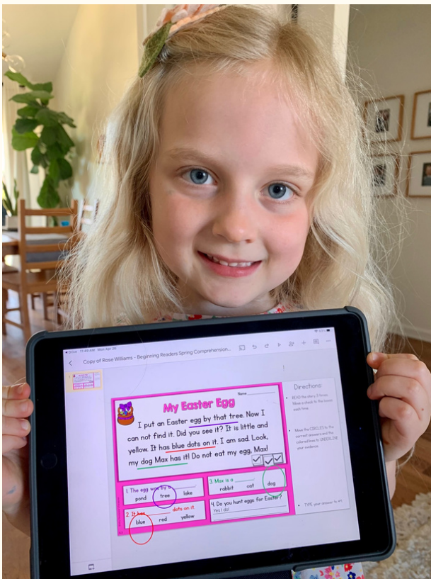
Floyds Knobs Elementary