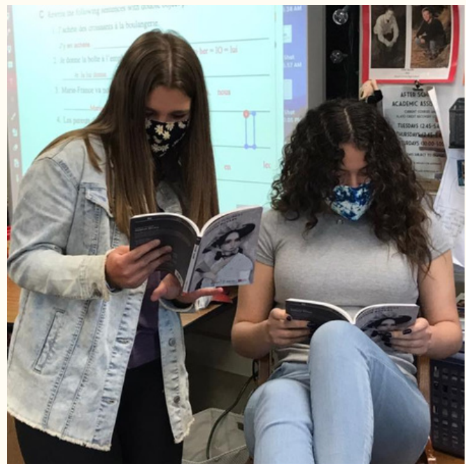
New Albany High School