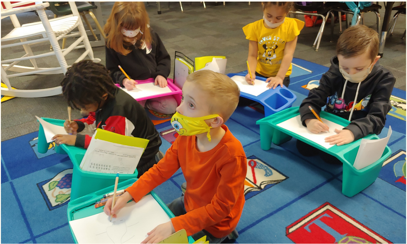
Mt. Tabor Elementary